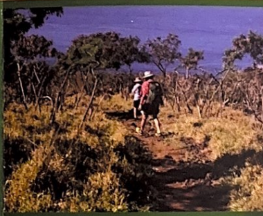
Trail to Kealakekua Bay