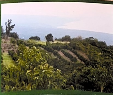
Coffee lands S.Kona

Email us: akelepolo777@yahoo.com or hecht.deb@gmail.com